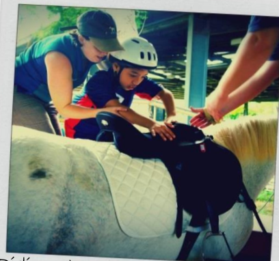
Riding has developed his trunk control, core and balance, all the while keeping a big smile on his face