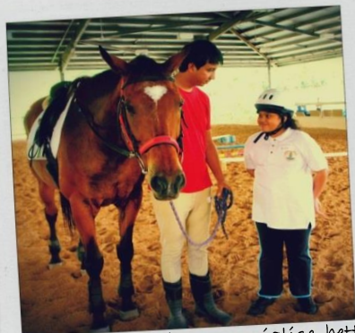
She has been able to socialise better which has increased her self esteem and confidence in herself