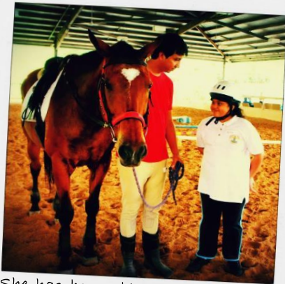
She has been able to socialise better which has increased her self esteem and confidence in herself