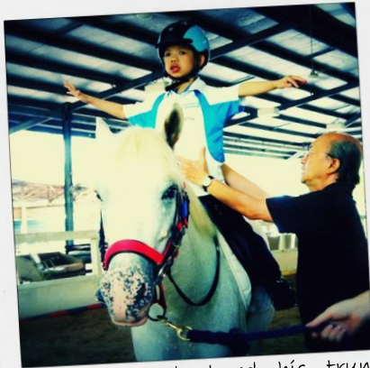
Riding has developed his trunk control, core and balance, all the while keeping a big smile on his face