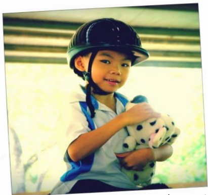
His communication skills improved and he's able to express himself better after RDA program