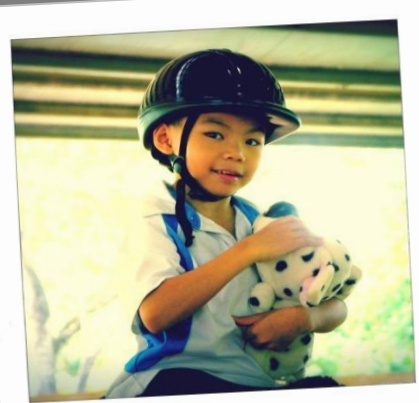
His communication skills improved and he's able to express himself better after RDA program