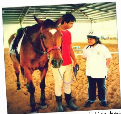
She has been able to socialise better which has increased her self esteem and confidence in herself