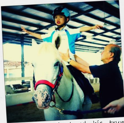
Riding has developed his trunk control, core and balance, all the while keeping a big smile on his face