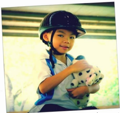
His communication skills improved and he's able to express himself better after RDA program